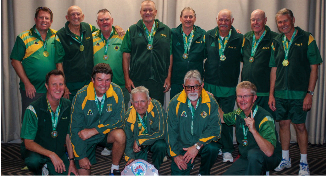
Senior Inter-Zone Championship Winners Zone 9

Zone 9 clinched the 2023/24 Senior Inter-Zone Sides Championship, defeating last year's runners-up, Zone 2, in the final held at NBC Sports.