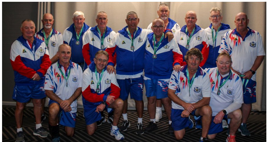
Senior Inter-Zone Championship Runner-up Zone 2

Zone 2 mounted a strong comeback over the next 10 ends, closing the gap to just two shots. However, another five-shots to Green's team allowed Zone 9 to solidify their lead as they started to surge ahead across all three rinks. Despite Zone 2's