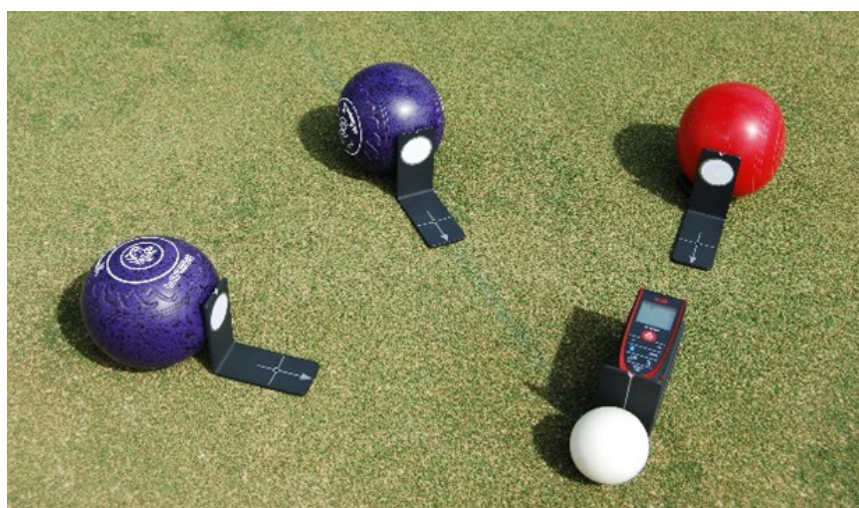
Bowlsline Laser Measure Bowlsline Laser Measure