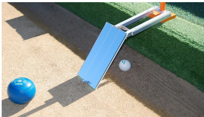
Itzy Easy Siter (made in Queensland & approved by BA)

A: You ignore the position of the mat, law 6.1.4, and proceed to the head to perform the requested measure.