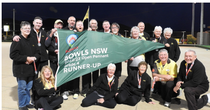
Grade 4 Runner-up Wingham