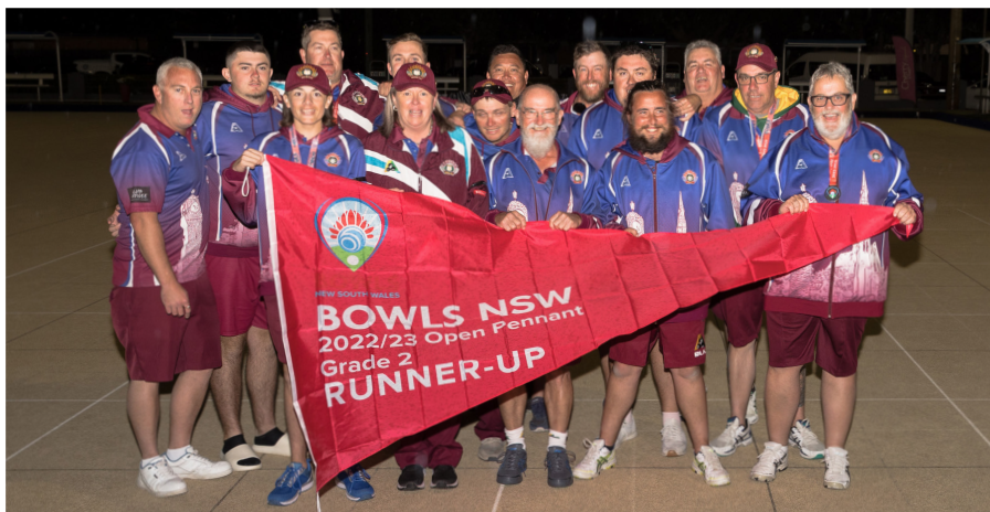
Grade 2 Runner-up Mudgee