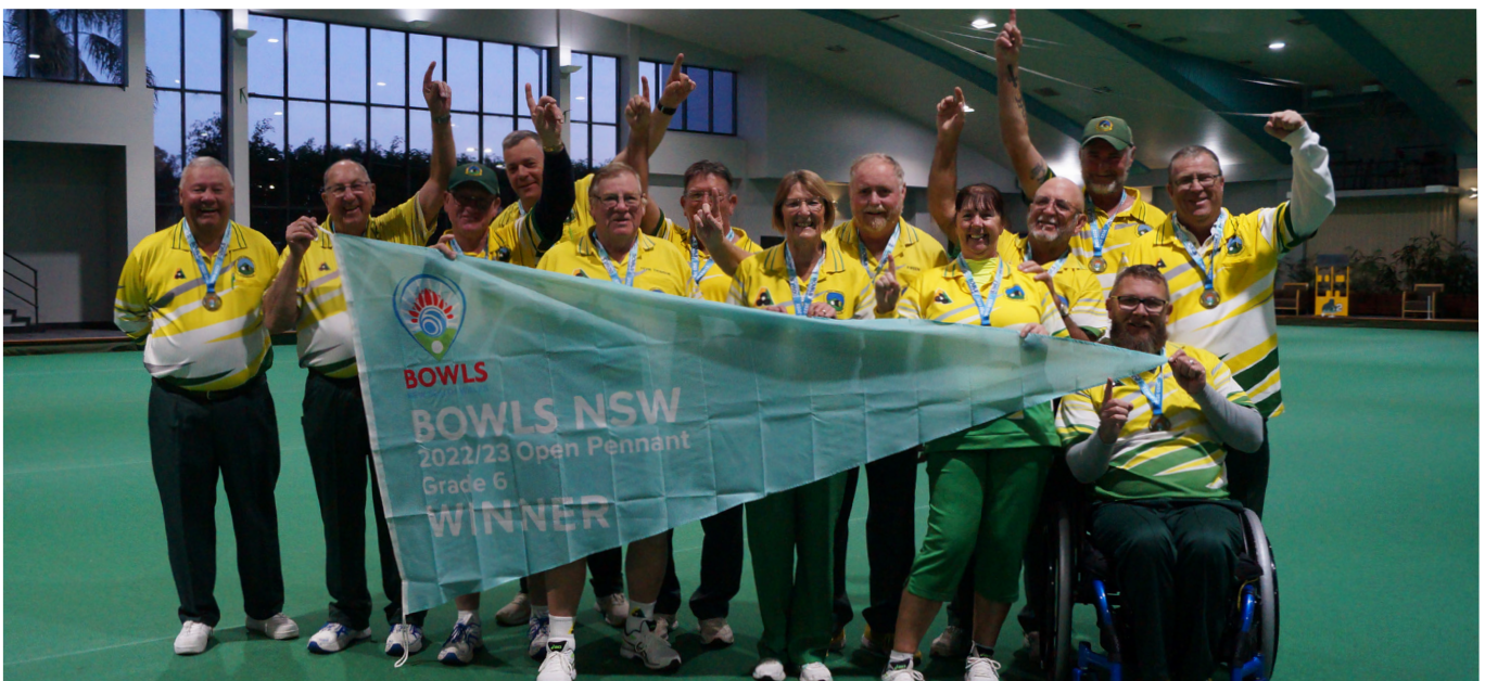
Grade 6 Winner South Tamworth

To watch our live streamed matches please go online to the Bowls NSW Facebook page or www.bowlsnsw.com.au