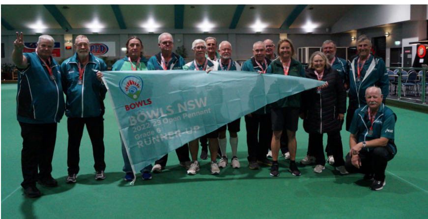
Grade 6 Runner-up Warilla