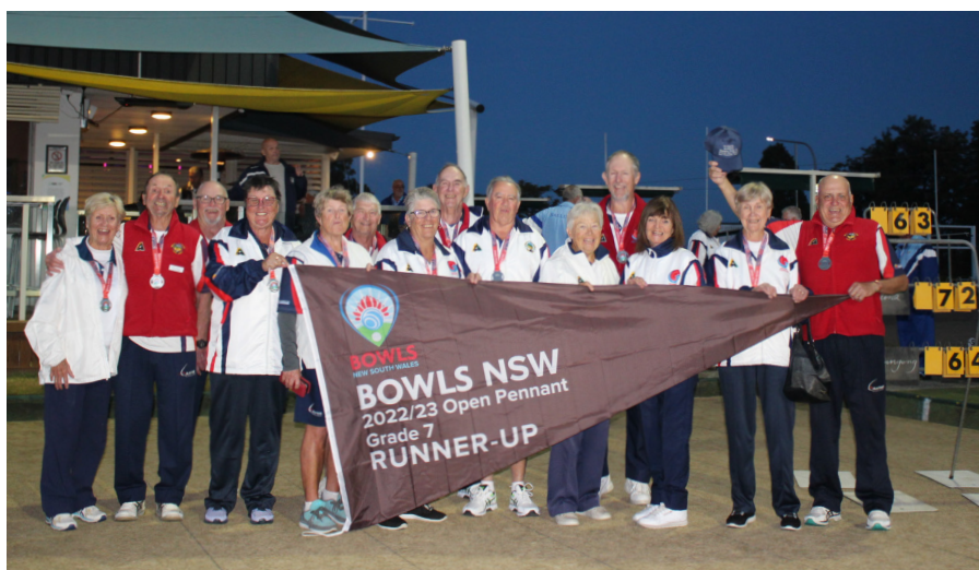
Grade 7 Runner-up Gerringong