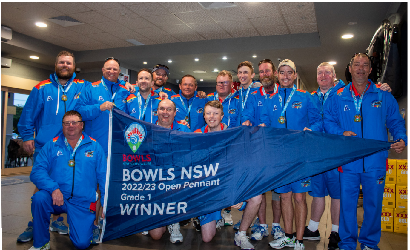
Grade 1 Winner Raymond Terrace