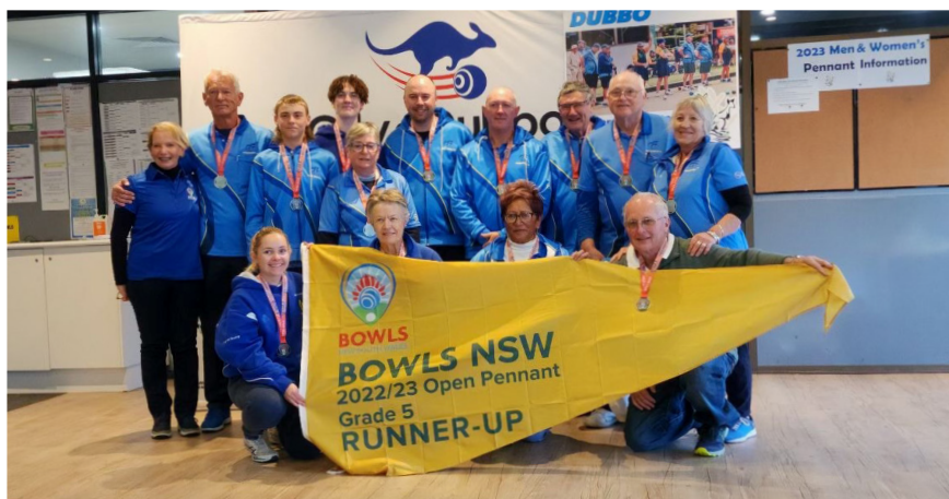
Grade 5 Runner-up Merimbula