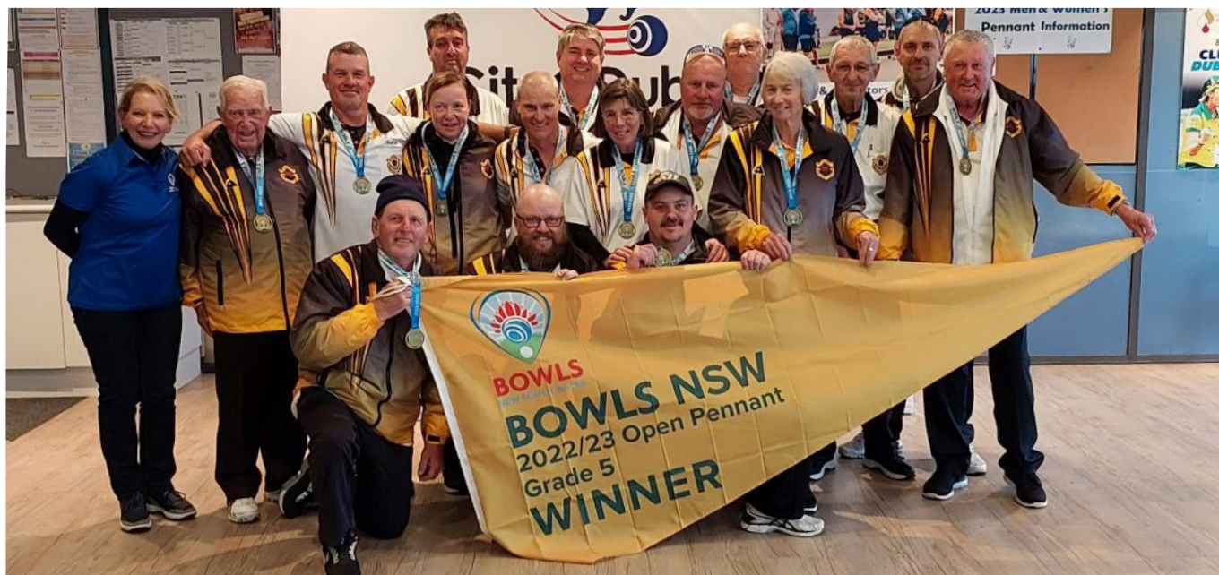
Grade 5 Winner Quirindi