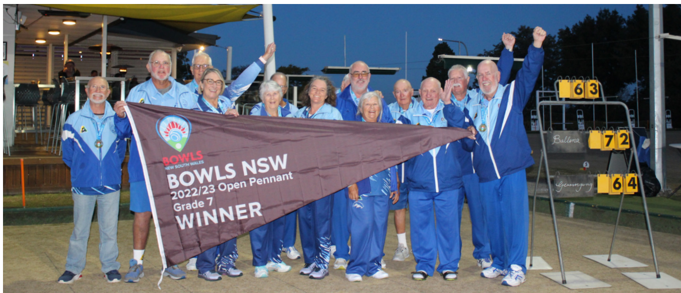
Grade 7 Winner Ballina

It looked like it was going to go down to the wire however Ballina had other thoughts and some great lead bowls and final shot conversions saw them maintain their lead to become Grade 7 State champions.