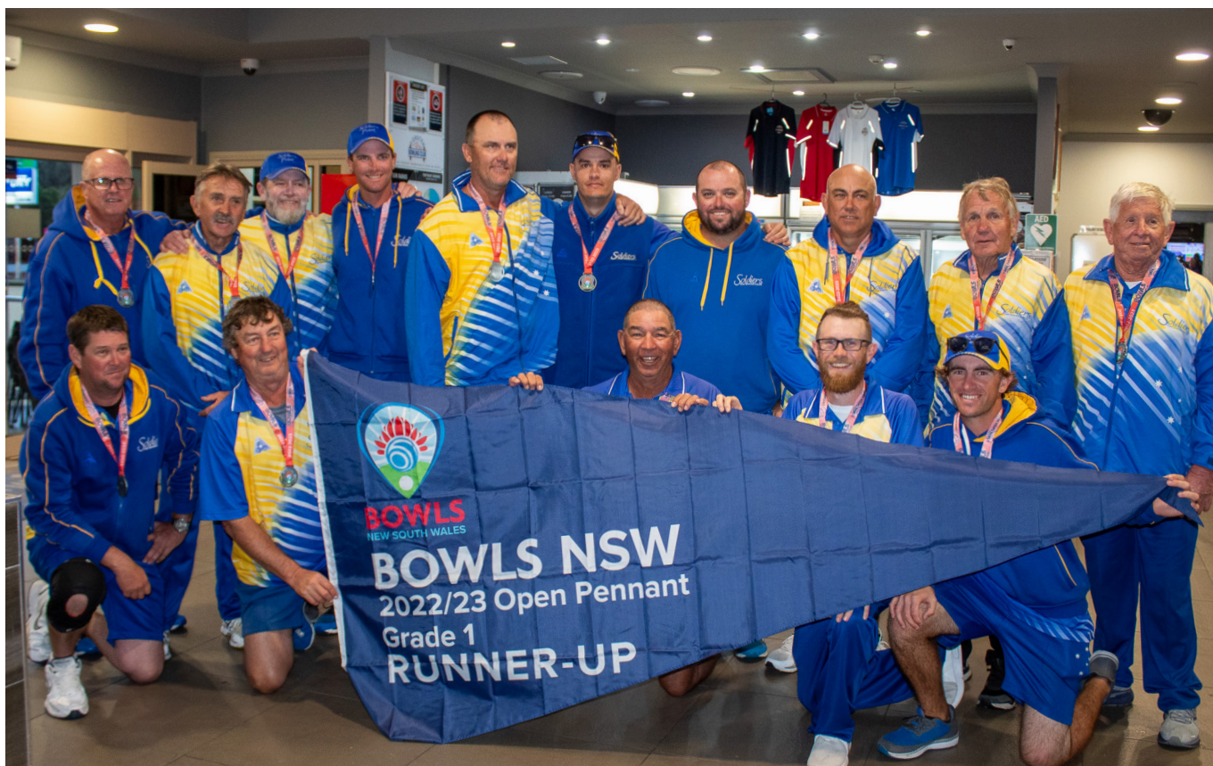
Grade 1 Runner-up Soldiers Point