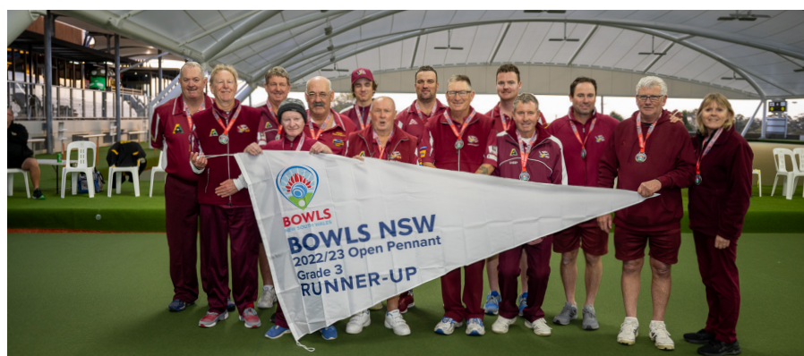
Grade 3 Runner-up Tathra Beach