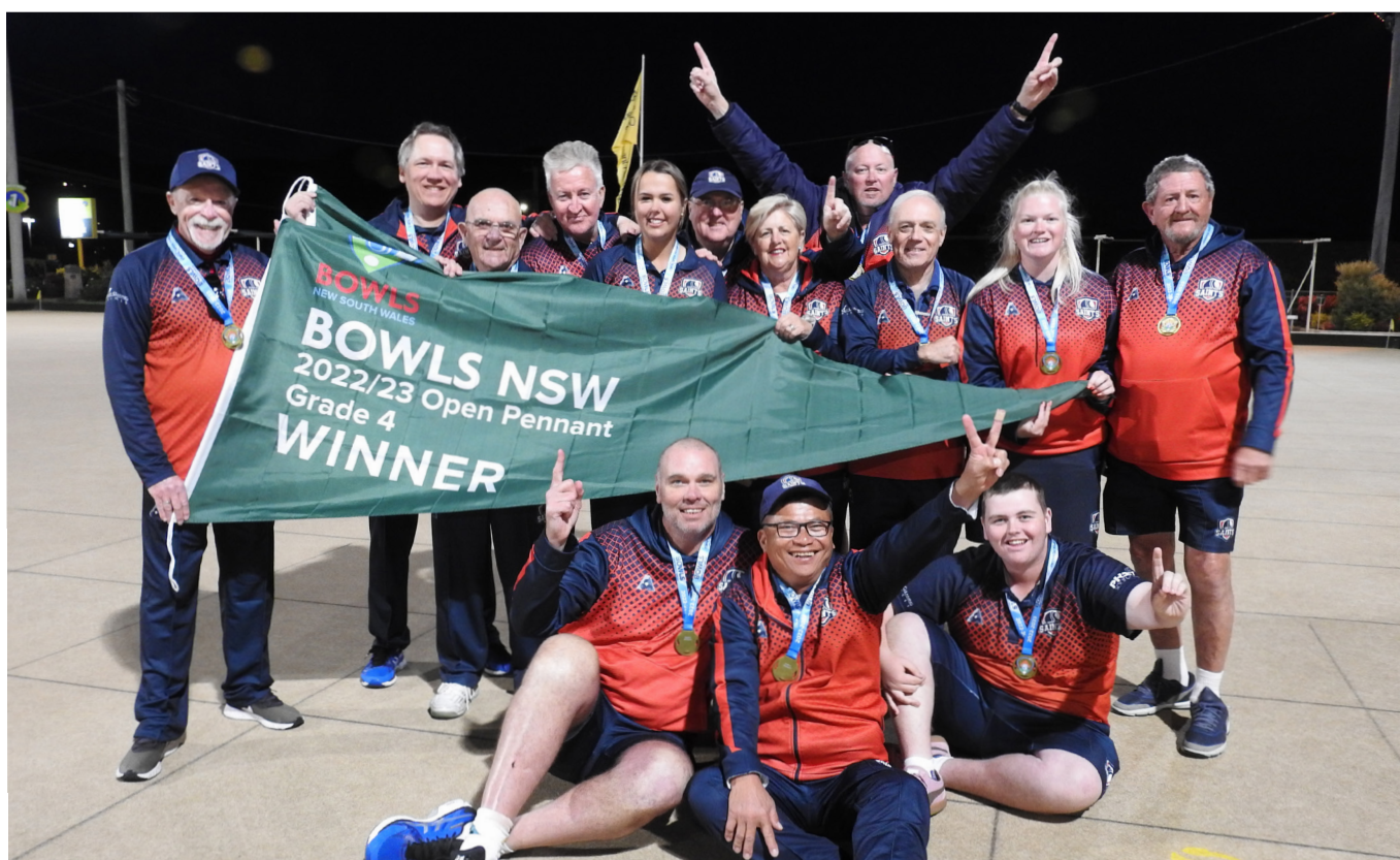
Grade 4 Winner St Johns Park

West Tamworth Bowling Club and North Tamworth Bowling Club, with all finals played at South Tamworth.