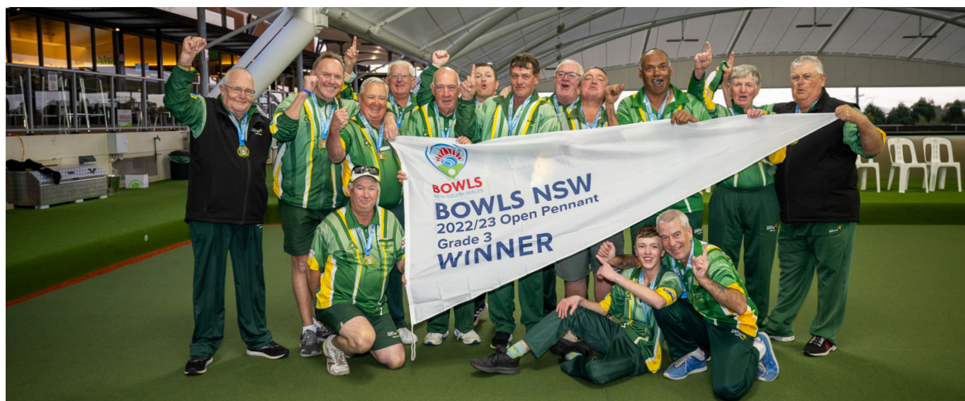
Grade 3 Winner Wagga Rules

Well done to all competing sides, and congratulations Tathra Beach on a well deserved win.