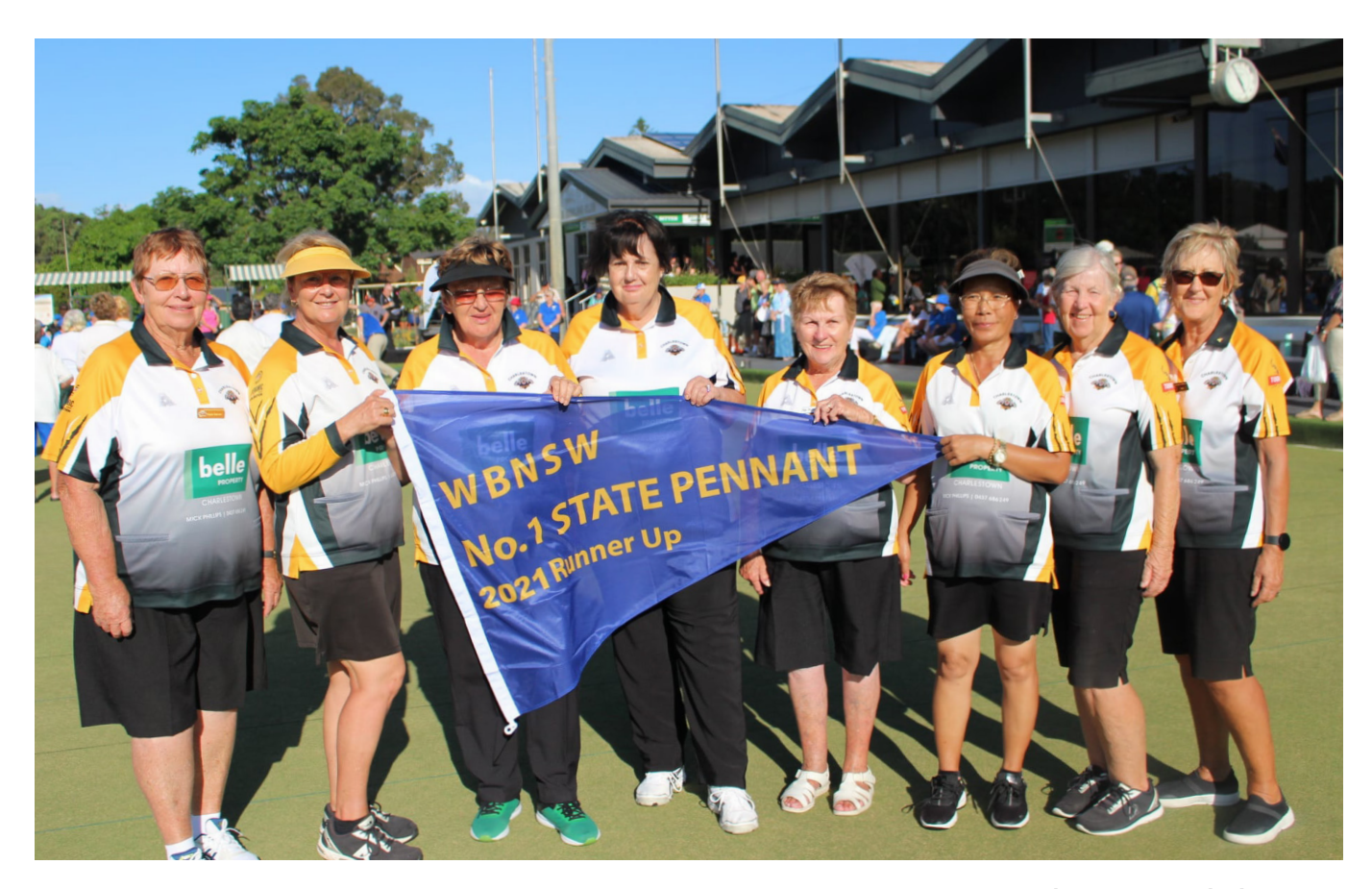
Grade 1 Runner-up Charlestown