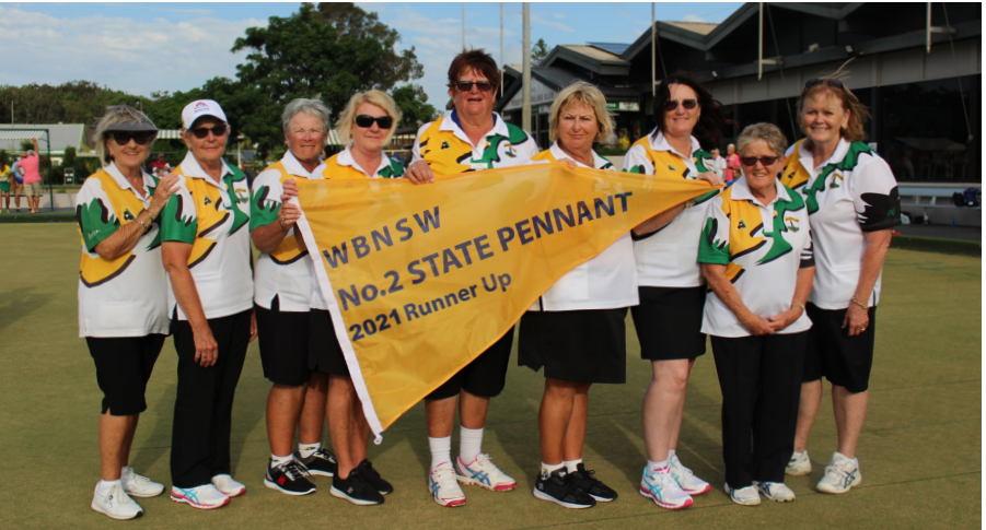
Grade 2 Runner-up Bomaderry