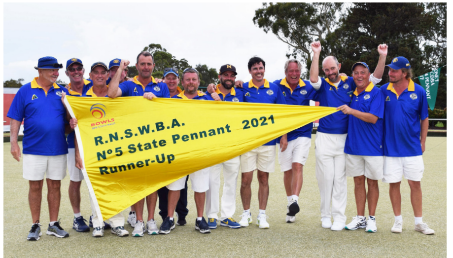
Grade 5 Runner-up Marrickville