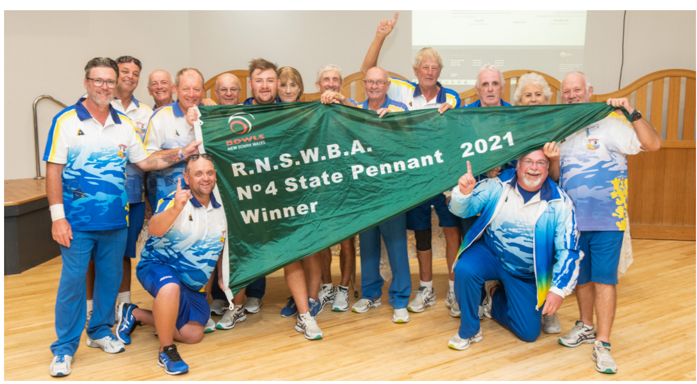
Grade 4 Winner Sawtell

Day 1 of competition arrived with a terrible 4-day weather forecast. Despite the forecast and some overnight rain, Friday began in perfect windless conditions, and on beautifully prepared greens the standard of bowling was exceptional. It was obvious that all these teams had earned their right to be