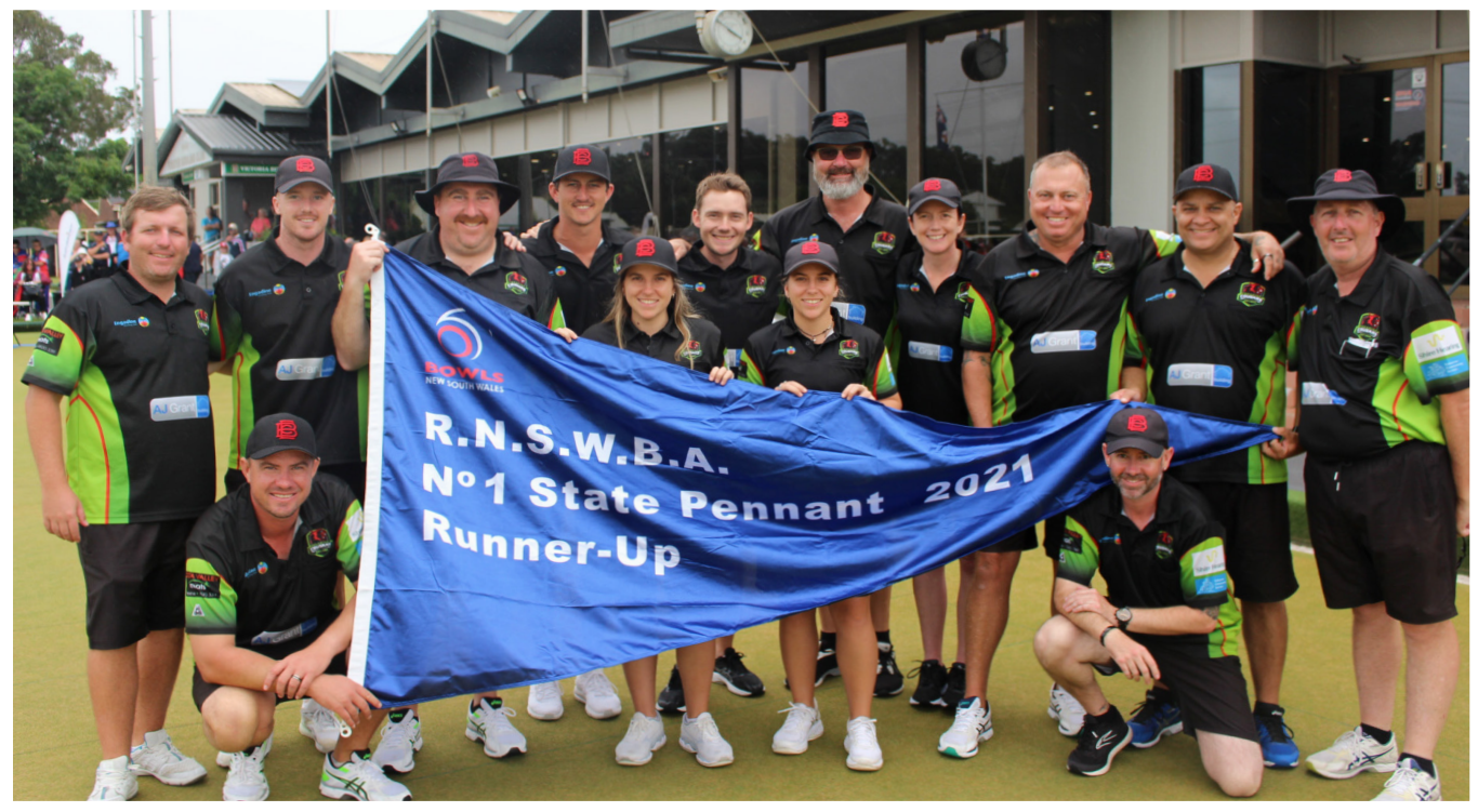
Grade 1 Runner-up Engadine

To watch our live streamed matches please go online to the Bowls NSW Facebook page or www.bowlsnsw.com.au