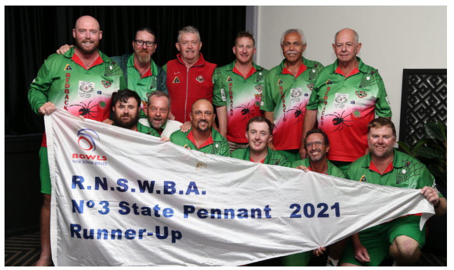
Grade 3 Runner-up Narrandera