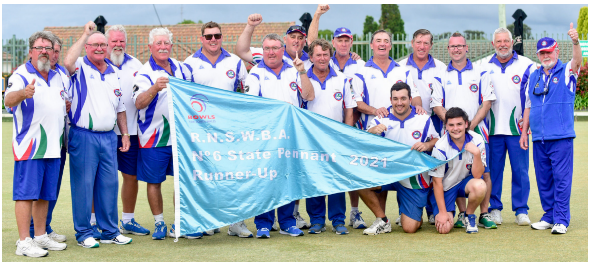
Grade 6 Runner-up Gresford