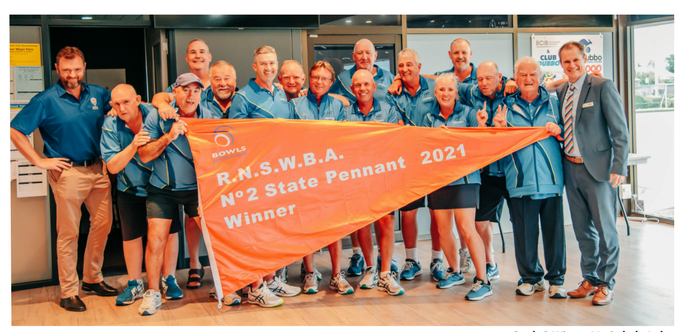
Grade 2 Winner Merimbula-Imlay

Merimbula-Imlay won Section 4. Both they and Cabramatta went through, with each team losing a game along the way. Forster and