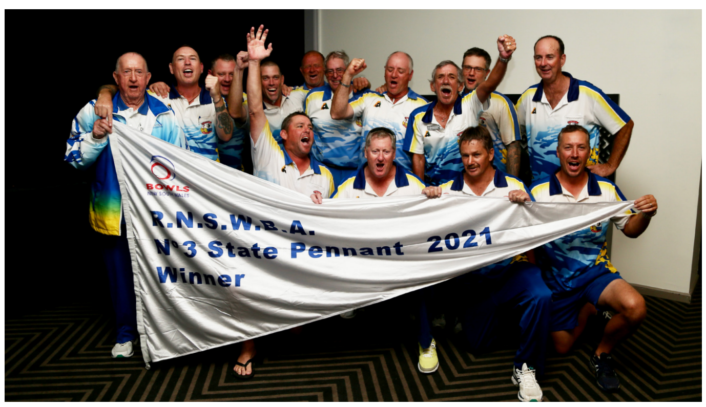
Grade 3 Winner Sawtell

At the completion of sectional play, Narrandera, Malua Bay, Denistone Sports and Cabra Vale Diggers all won their sections. In Section 3, just