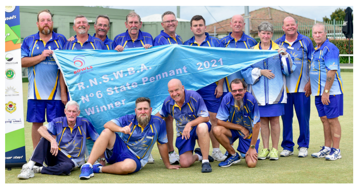
Grade 6 Winner Cabra-Vale Diggers