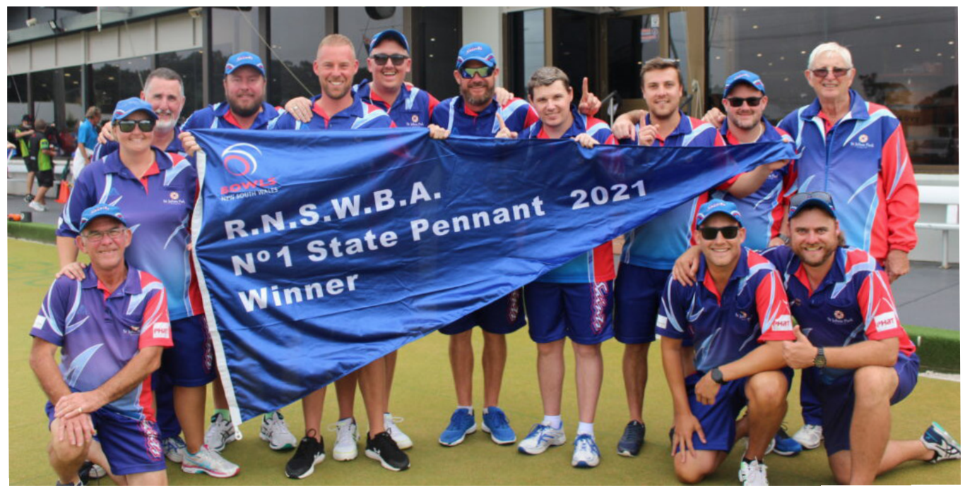
Grade 1 Winner St Johns Park