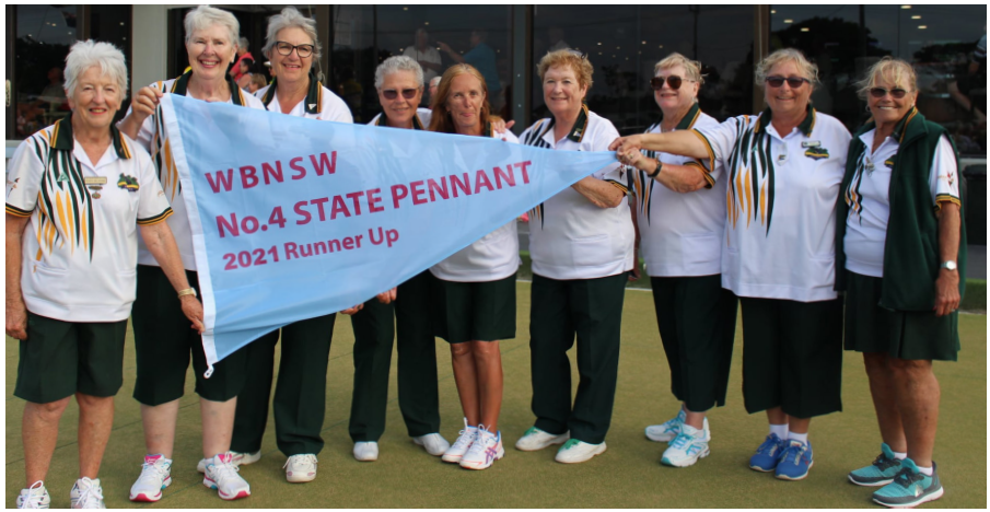
Grade 4 Runner-up Ingleburn

The Tathra Beach side saved their best performance for the big stage, with both rinks jumping out to a commanding lead against Ingleburn and they maintained that dominance throughout the final, cruising to a win. Ingleburn played admirably, but in the end were outclassed by the Tathra side.