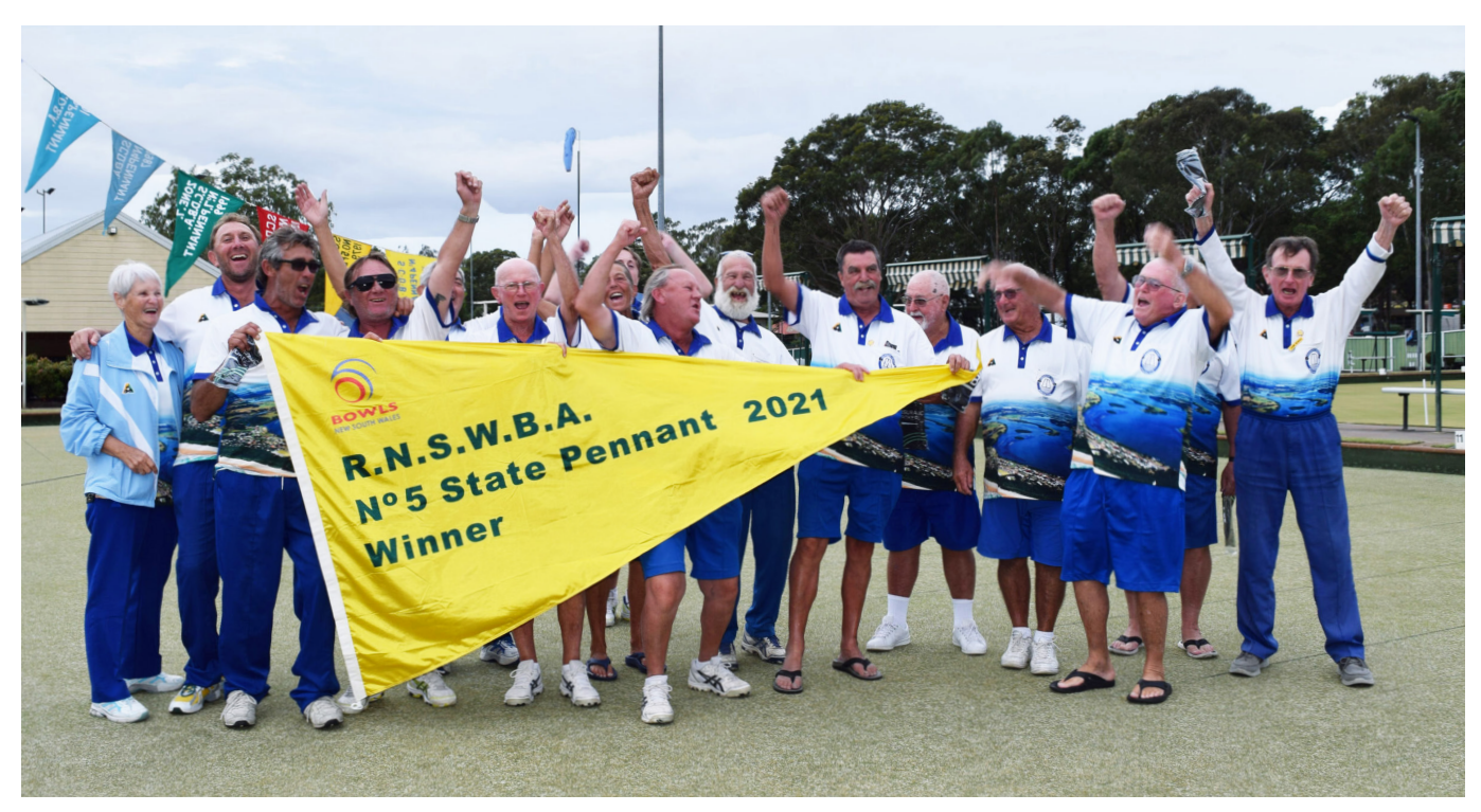
Grade 5 Winner Manning Point

"We took most things in our stride including the loss in the first game. We didn't look too far ahead so we