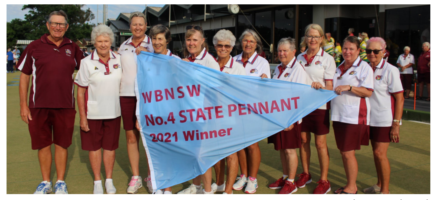
Grade 4 Winner Tathra Beach

In the semi-finals, Ingleburn dominated Yamba, winning both rinks in their 48 - 29 victory. Things weren't as easy for Tathra Beach, who were made to work by Figtree Sports. Tathra jumped out to what appeared to be an unassailable lead before Figtree Sports edged their way back into contention. It proved to be just too difficult for them as Tathra Beach held on for a 47-37 win to book their place in the final.