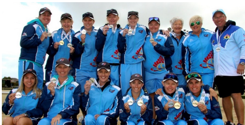
2017 Silver Medalists - National Sides Championships

Chair – Selection Committee, NSW Coach and National Assistant Coach