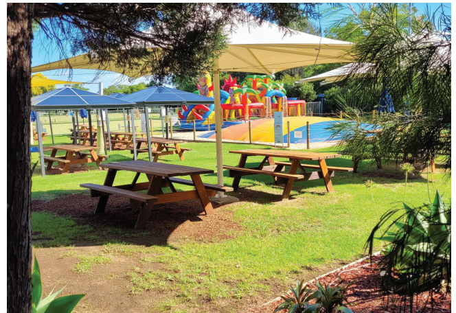
NBC Sports Club