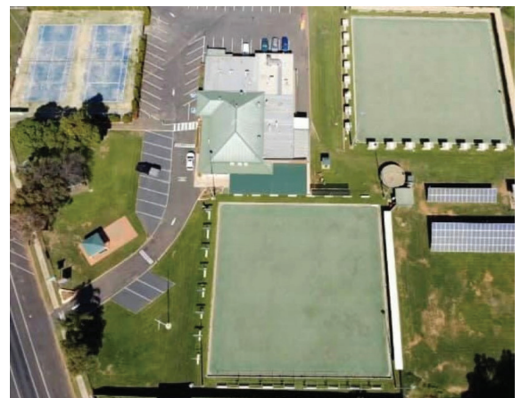
Dubbo Macquarie Club