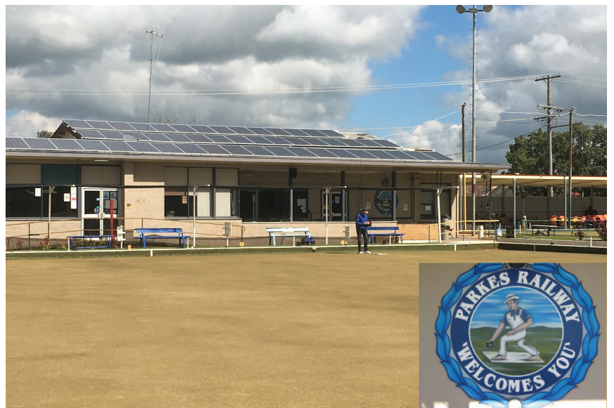
Parkes Railway Bowling Club