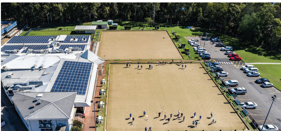
Toongabbie Bowling Club

The club continues to grow and attract new members and visitors with upgraded facilities and quality food and beverage offerings and hosting live bands once a month – or at least when Covid permits it.