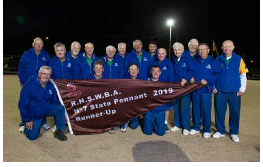
Grade 7 Runner up - Merrylands