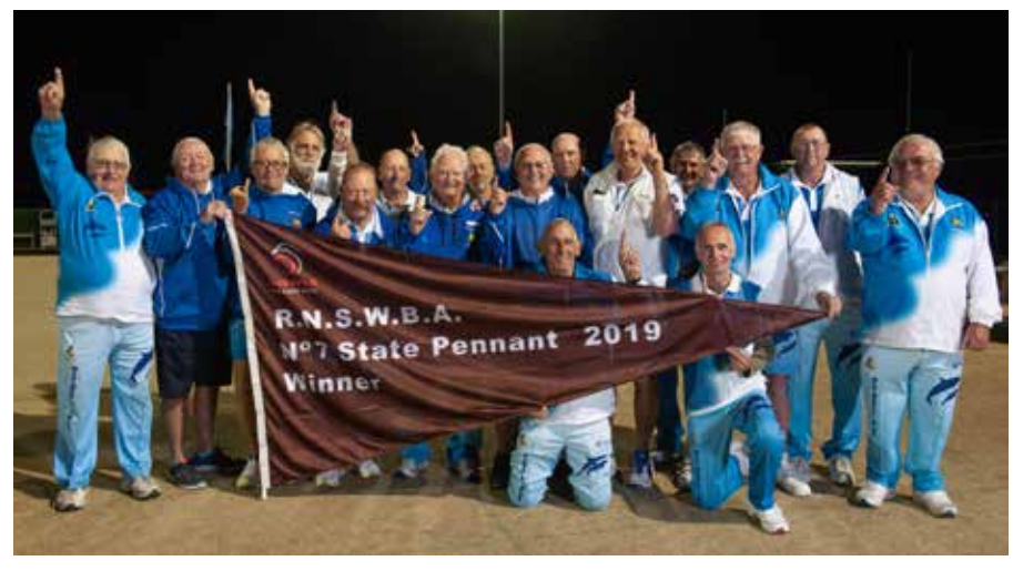
Grade 7 Winners - Merimbula

The victory was icing on the cake for Merimbula who progressed through the entire pennant season undefeated to claim the Club's 4th State Pennant in 4 years.