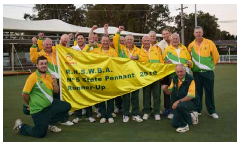
Grade 5 Runner up - Batlow

The Zone 14 side finished second in their section to Mounties and then won a quarter-final and semifinal before turning the tables on Mounties 64-46 in the final.