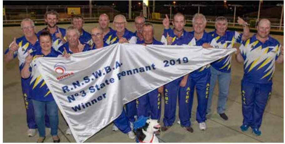
Grade 3 Winners - Armidale City

Junee Bowling Club celebrated their grandest achievement with a 68-54 grand final win over a dogged Leichhardt.