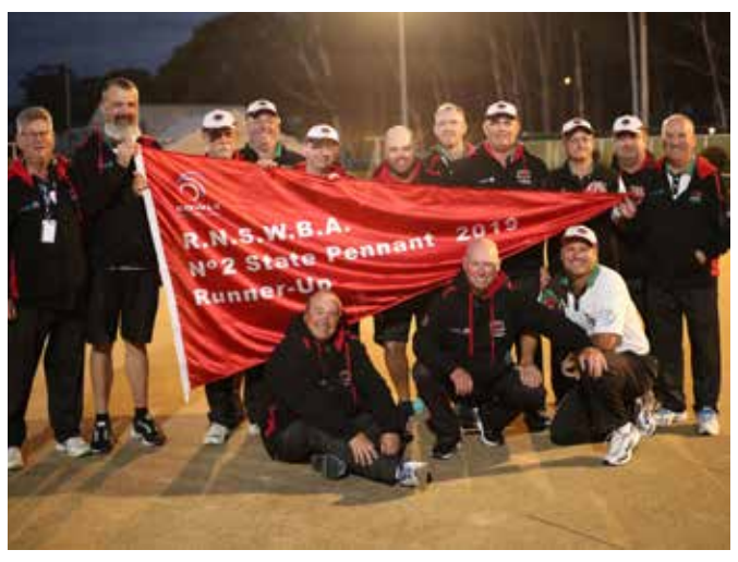
Grade 2 Runner up - Engadine