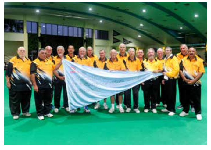
Grade 6 Runner up -Mounties