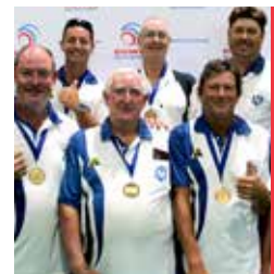
CLUB CHALLENGE STATE FINAL