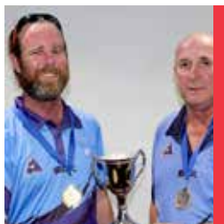
STATE OVER 40S PAIRS FINALS