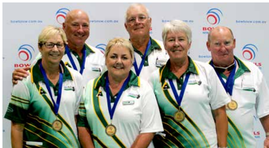
Oak Flats - 2018 Mixed Bronze Club Challenge Champions

The Bowls NSW Board of Directors has resolved that effective 1st October 2019, the requirement to be male in gender to register with Bowls NSW under the Bowls NSW Constitution and Regulations will be removed.