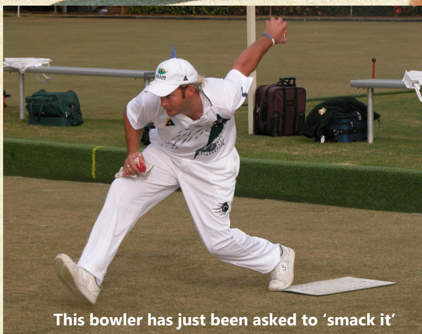
This bowler has just been asked to 'smack it'

Hit it, have a drive, have a run, smack it, rip him out, take it out, kill it – to have a forceful shot using maximum weight comfortable to the individual.